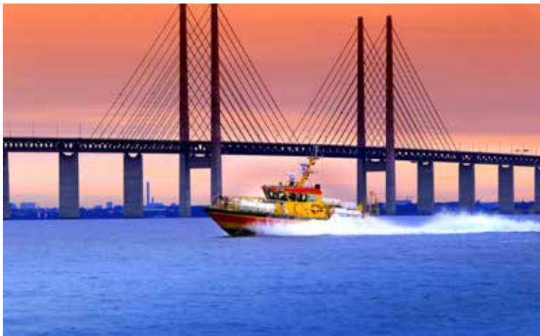
An airport rescue boat

A command post should be established at the most feasible location on an adjacent shore.