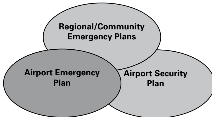
Graphic from FAA AC 150/5200 – 31C (Figure 2 – 1)

The following graphic illustrates the need to have an AEP incorporated into other plans.