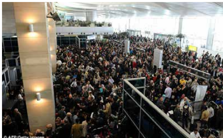
Cairo Airport – Egypt Civil Unrest

Civil unrest and mass protests can seriously disrupt tourism and air transport. Aerodromes are key assets linking different regions and countries, and in order to maintain this connectivity, aerodromes should be kept safe and secure during times of civil unrest.