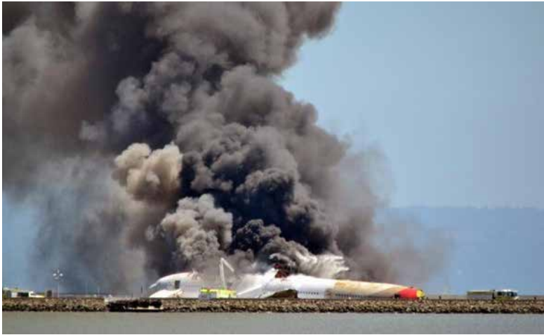
Aircraft accident at San Francisco – Boeing 777-200ER

A description of and specific identification of fire-fighting equipment and fire-fighting teams should be included in the AEP. Aircraft fires and structural fires will utilize different types of fire trucks and employ different numbers of firefighters.