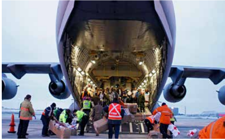
Supplies being loaded into a transport aircraft.