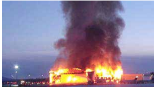
Hangar at Prince George Airport, British Columbia

Compared to aircraft fires, structural fires require specific fire-fighting equipment, such as trucks with extra-long ladders. The AEP should address the differences.