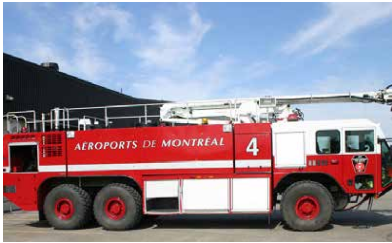
Montreal Airport RFF vehicle

Aerodrome categories for rescue and fire-fighting are based on the overall length of the longest aeroplane normally using the aerodrome and its maximum fuselage width, as detailed in table 9-1 in ICAO Annex 14 .