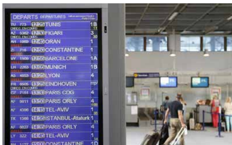
An air traffic controllers' strike in France went into a second day, forcing the cancellation of 1,800 flights.

When responding to strikes and work stoppages, the following information could be included in the AEP: