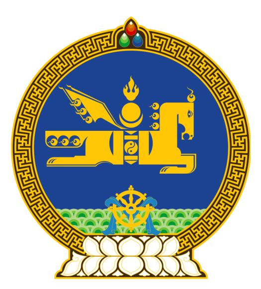
Fig. 2: State Emblem of Mongolia

In the margins, at the upper right is the state emblem (Figure 2), whereas four Mongolian flags, each twinned with a UN flag, embellish left and right of the sheet.