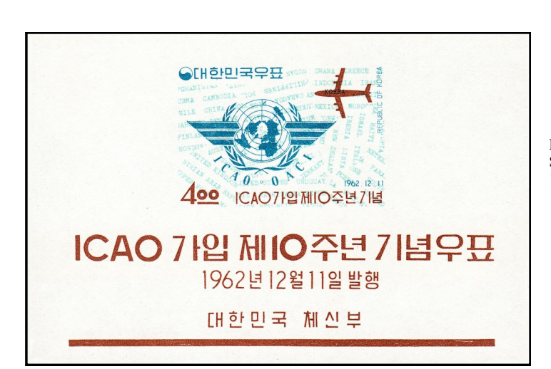
Fig. 5: 1962 Republic of Korea Stamp for 10th Anniversary of Joining ICAO

On December 11, 1977, with a stamp (Figure 7) for the 25th anniversary.