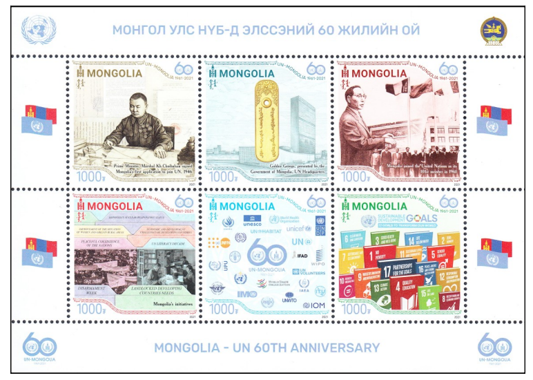
Fig. 1: 2021 Miniature Sheet issued by Mongolia For the 60th Anniversary of Admission to the UN

The entry of the Mongolian People's Republic (MPR) into the UN, from its first application in 1946, took 15 years. In the context of the global Cold War, UN membership became a tool to strengthen the influence of the USA and the Soviet Union. They sup-