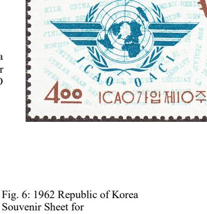
Souvenir Sheet for 10th Anniversary of Joining ICAO