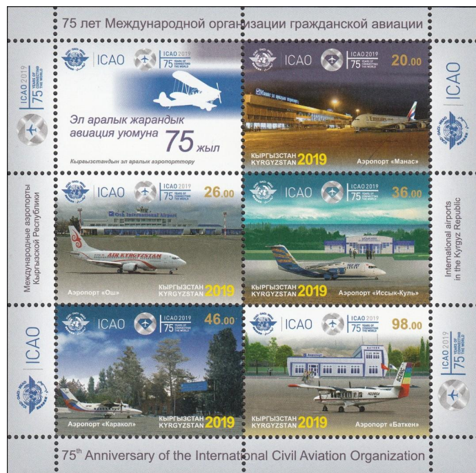
Figure 3: Kyrgyzstan Scott #620

Kyrgyzstan released their stamp on December 13, 2019. It is a sheetlet (Figure 3) with one label and five stamps that feature international airports of the country, from the largest airports Манас (Manas) and Ош (Osh) airports to much smaller airports of Иссык-Куль (Issyk-Kul), Каракол (Karakol) and Баткен (Batken). For each stamp, a different aircraft is stationed in front the airport. The margins of this leaflet are beautifully decorated with the ICAO logo and that of the 75th anniversary.