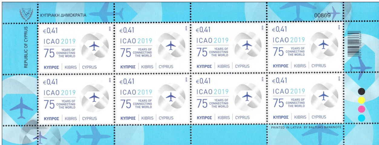
Figure 9: Cyprus Scott #1318

The First Regional Air Navigation Meeting for the Middle East Region was held in October 1946 in Cairo, Egypt. This country took this opportunity to overprint one of its stamps for the commemoration of this meeting; this is the only stamp from the topical collection issued during the lifetime of PICAQ, the Provisional International Civil Aviation Organization. Egypt released an admirably luminous blue stamp on December 7, 2019 picturing the 75th anniversary emblem (Figure 10). Note the syncopated perforations at the top and bottom of the stamps.