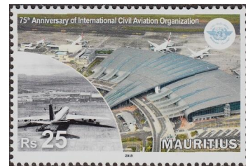
Figure 2: Mauritius Scott #1202

The stamps of two States feature international airports in their countries because they are the key interface between the passengers and the aircraft, and the location where every flight begins and ends. Airports are a fundamental component of every State's socio-economic well-being. The stamp of Mauritius (Figure 2) that was released on December 7, 2019 shows the new passenger terminal at the Sir Seewoosagur Ramgoolam (SSR). The international airport, that was inaugurated on August 30, 2013, has a structure that was designed after the tropical "Traveller's Palm" (Ravenala madagascariensis), a genus of flowering plants.