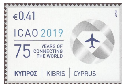
Figure 8: Cyprus Scott #1318

As per regular practice in past, Cyprus again commemorated several events and anniversaries in one issue released on September 10, 2019. The ICAO stamp of this issue (Figure 8) reproduces the special theme of the 75th anniversary on a white background, while the margins of the sheetlet of 8 stamps (Figure 9) are nicely adorned with the special emblem of the anniversary.