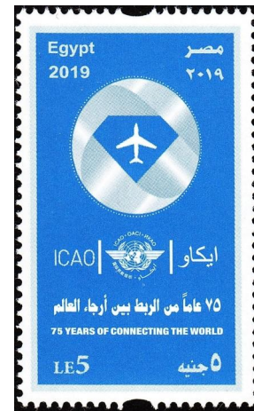
Figure 10: Egypt Scott #2219

The First Regional Air Navigation Meeting for the Middle East Region was held in October 1946 in Cairo, Egypt. This country took this opportunity to overprint one of its stamps for the commemoration of this meeting; this is the only stamp from the topical collection issued during the lifetime of PICAQ, the Provisional International Civil Aviation Organization. Egypt released an admirably luminous blue stamp on December 7, 2019 picturing the 75th anniversary emblem (Figure 10). Note the syncopated perforations at the top and bottom of the stamps.