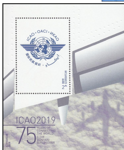
Figure 6: Azerbaijan Scott #1234

Azerbaijan released a miniature sheet (Figure 6) on the opening day of the 40th Session of ICAO's Assembly on September 24, 2019. The sheet depicts an airplane wing against a background of clouds; the wings of ICAO's emblem are used as the horizontal bars for the embossed 7 and 5 digits. The cachet of the related first-day cover (Figure 7) shows the figure 75 surrounding the compressor fins of a jet engine.