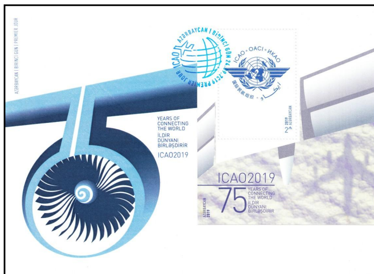
Figure 7: Azerbaijan FDC

Azerbaijan released a miniature sheet (Figure 6) on the opening day of the 40th Session of ICAO's Assembly on September 24, 2019. The sheet depicts an airplane wing against a background of clouds; the wings of ICAO's emblem are used as the horizontal bars for the embossed 7 and 5 digits. The cachet of the related first-day cover (Figure 7) shows the figure 75 surrounding the compressor fins of a jet engine.