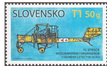
Figure 1: Slovakia Scott #814

Slovakia was the first country to issue a stamp on April 4, 2019. Their stamp (Figure 1) shows an Italian bomber Caproni Ca.3 that references General Milan Rastislav Štefánik who died in this aircraft 100 years earlier near Bratislava on May 4, 1919 on his return home from Italy to see his family. Štefánik was an important figure in the creation of Czechoslovakia. The date of this stamp's issue corresponds exactly to the 72nd anniversary of the entry into force of the Chicago Convention.