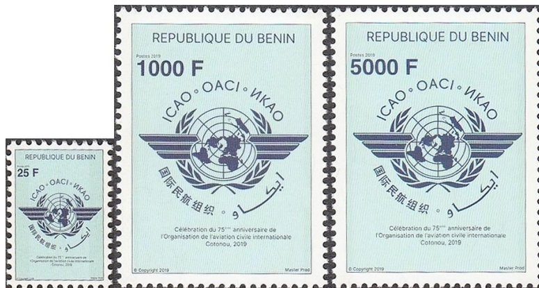
Figure 11: Benin Michel #1676-8

Formerly named Dahomey and today officially named la République du Bénin, Benin was the only country from the African region to release on December 7, 2019 three values of the same stamp showing the ICAO's logo. On a coral blue background, the text on the stamps (Figure 11) reminds us that French is the official language of Benin.