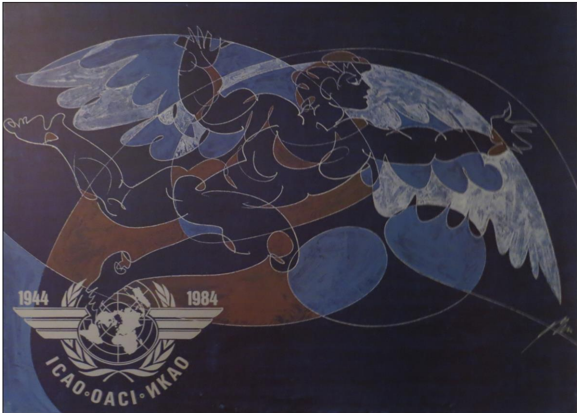
Figure 3: Poster prepared for the 40 th anniversary of ICAO.