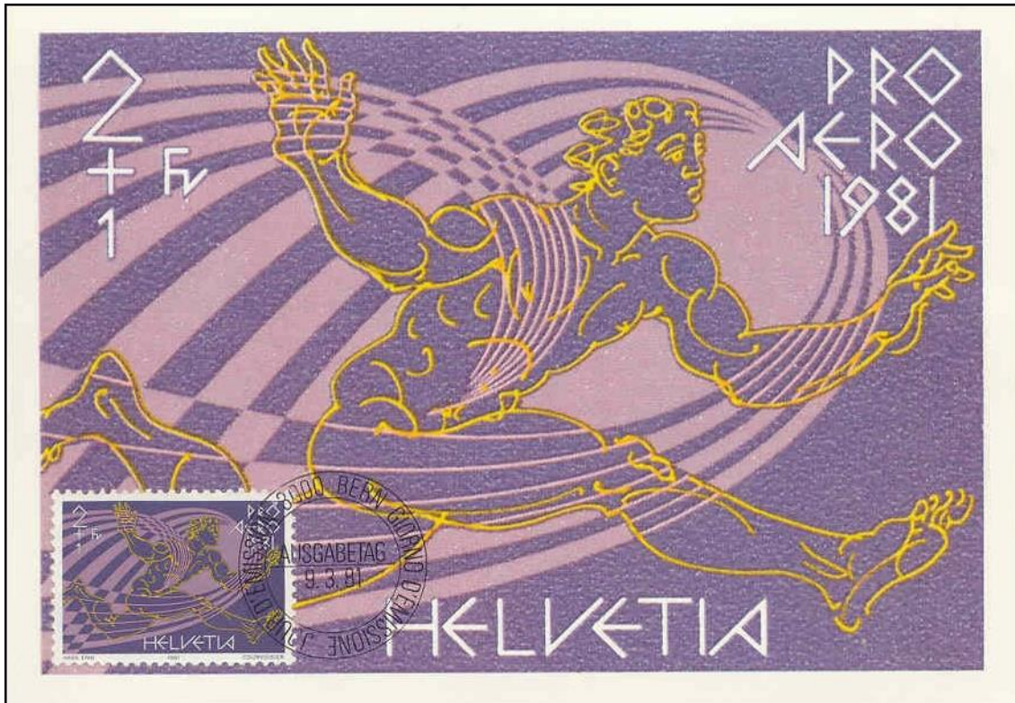
Figure 5: Maximum card issued by Switzerland for the 50 th anniversary of Swissair.