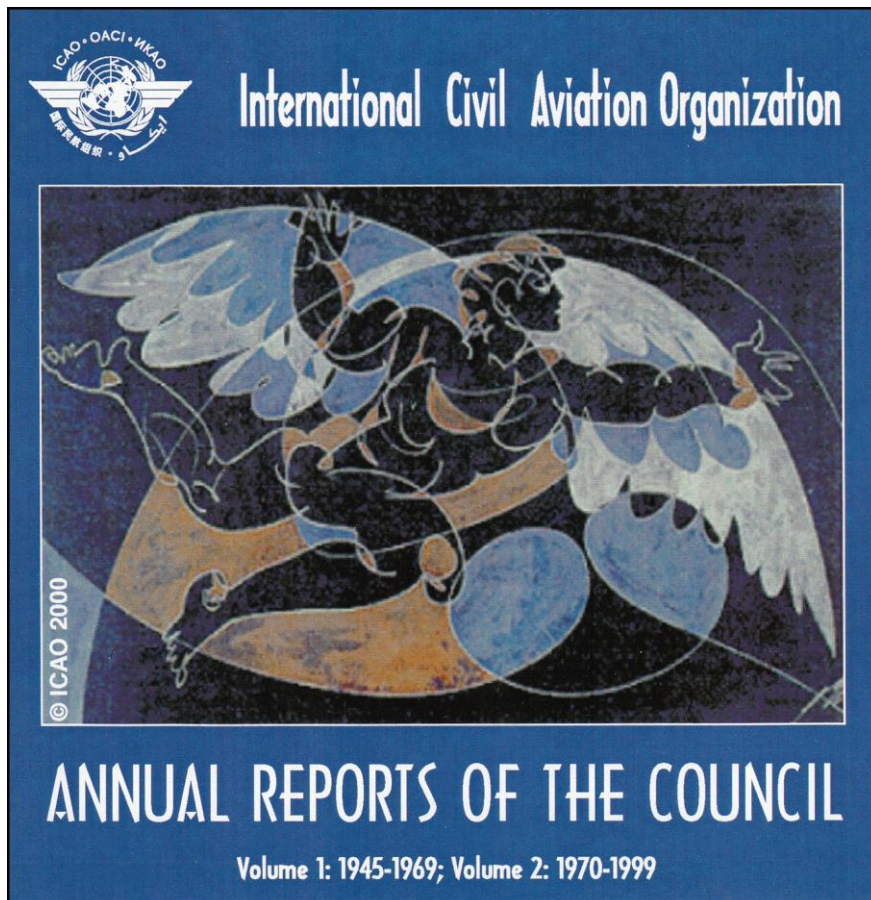
Figure 4: Front cover of a CD showing Icarus flying towards the sun.